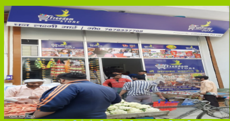
FREEDOM GROCERY STORE