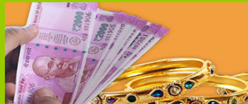
FREEDOM SOCIETY WITH LOAN